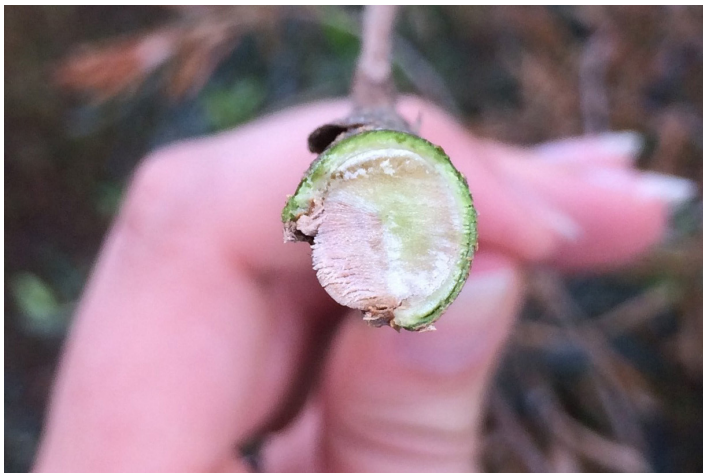
Figure 10. A pie-shaped mark of brown discoloration is a diagnostic feature of Botryosphaeria dothidea on olive in Florida.