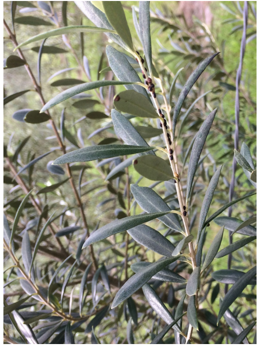
Figure 4. Black scale and sooty mold on an olive tree.

Fire ants can pose a nuisance in a variety of landscapes, including fruit orchards. Fire ants form mounds that can extend deep belowground and contain thousands of individual ants, making them difficult to control. Ants can cause a variety of problems in an olive grove: protecting populations of honeydew-secreting insect pests (like black scale) on trees, tunneling beside trees and disrupting their root systems or irrigation lines, and inflicting painful stings to those working in the field.