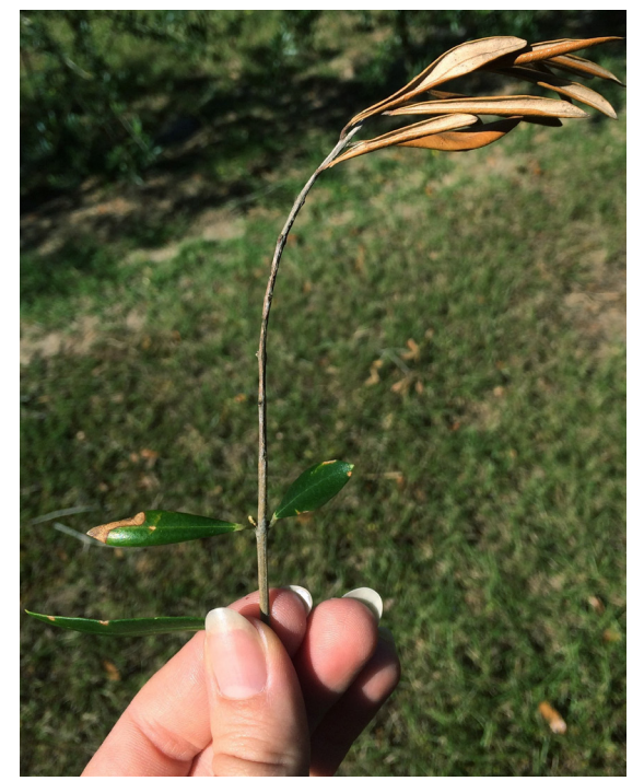
Figure 9. Symptoms of Botryosphaeria dothidea include tip or twig wilt or dieback—leaves will be dead, brown, and desiccated but still attached to the tree. Credits: Morgan Byron

the UF Plant Diagnostic Center. Photo of symptoms can be found in this factsheet: http://cesonoma.ucanr.edu/ files/37245.pdf.