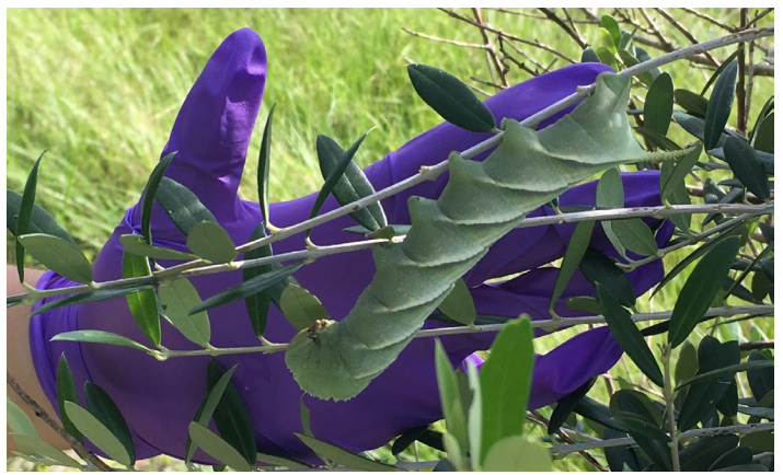
Figure 7. A hornworm caterpillar feeding on olive in Florida.

The caterpillar life stage of the native moth species Manduca rustica has been found to quickly defoliate young olive trees in Florida (Figure 7). The caterpillar is called a hornworm because of the characteristic curved, hornlike protrusion on the end of its abdomen. Hornworms are green with light yellow diagonal stripes. Eggs of the hornworm have been found laid singly on olive leaves, and the caterpillars voraciously feed on olive leaves and grow to be around eight cm in length. Growers have reported feeding as early as May, and we recommend scouting for eggs and caterpillars beginning in April. Immediate control measures are recommended upon detection of hornworms because they cause rapid and extensive damage. Some hornworms have been detected with parasites in their egg and caterpillar form, so the use of reduced-risk pesticides is recommended.