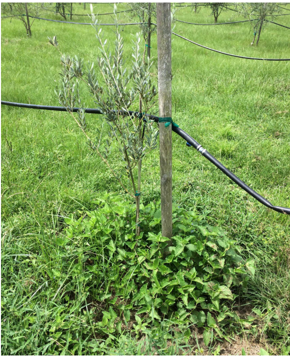
Figure 3. A two-year-old olive tree surrounded by weeds in north central Florida.