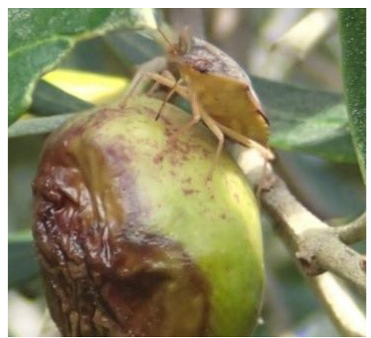
Figure 8. A stink bug feeding on olive in Florida.

Stink bugs are the common name for many plant-feeding insects that produce a defensive, smelly chemical when disturbed (Figure 8). Leaffooted bugs are typically more elongated than stink bugs, and have characteristic hind legs that often are enlarged and described as leaf-like in shape. Stink bugs and leaffooted bugs remain in their adult life stage in winter months and are most active April through September in Florida olive groves. Although stink bugs and leaffooted bugs damage olive leaves and fruit, the economic threshold for their control in Florida olive is unknown because many groves have not yet reached full productive potential. Scouting for these bugs beginning in April is recommended, and monitoring should be done throughout fruit development in summer months and harvest, which is typically in September. Using traps that are visually and chemically attractive to stink bugs such as yellow pyramid traps baited with lures is a good way to suppress populations of stink bugs. These bugs are very mobile, and insecticides are not very effective control measures for them. There are many beneficial predatory stink bug species and other insects that are beneficial and appear very similar to pest stink bugs. If you are unsure whether you have a pest or beneficial stink bug, Stink Bugs and Leaffooted Bugs Are Important Fruit, Nut, Seed, and Vegetable Pests is useful and available here: http://edis.ifas.ufl.edu/in534.