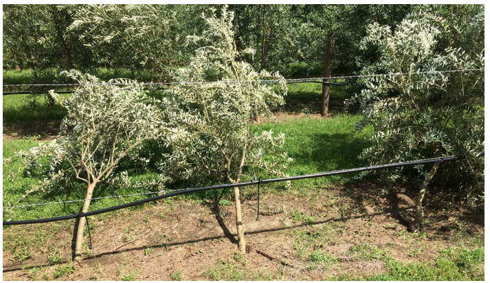
Figure 2. Five-year-old olive tree knocked over by tropical storm winds in north central Florida.

Hurricanes can present a problem in olive groves in Florida, as can thunderstorms with high winds throughout the year. These storms are most prevalent in the summer. High winds, combined with frequent rainfall softening the ground, can cause trees to tip over (Figure 2). After a hurricane, trees may need to be moved into the upright position and tied to metal/wooden supports or new poles in the ground (PVC, wood, bamboo for young trees, and stakes with tie-downs for older trees).