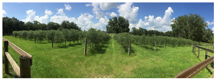
Figure 1. A four-year-old olive grove in north central Florida.

Healthy, well-maintained trees (Figure 1) will require fewer inputs in terms of pest management. For the olive trees to remain in optimal health and produce optimal yield, there are many things to consider, namely nutrition, irrigation, tree variety and location, and pest issues. The cornerstone to any successful integrated pest management (IPM) plan is caring for plants in a way that promotes optimum plant health. Early detection and suppression of pests will also reduce unnecessary pesticide applications. This guide touches on some aspects of olive tree health that will help your trees develop their natural resistance to pests and pathogens. At the end of this guide there is a monthly care and observation schedule to help you know when you should begin scouting for key pests and when important grove-management decisions should be made.