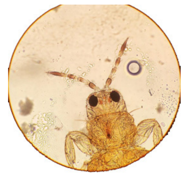
Figure 6. Magnified view of thrips collected from olive in Florida.

Flower thrips are tiny insects that feed on flowers of a wide variety of plants (Figure 6). The species most common in Florida olive groves is a tiny yellow thrips called Frankliniella bispinosa. To detect these insects in your grove, you can tap branches with open flowers onto a white piece of paper and use a hand lens to see if any of these minute insects are present. Flower thrips may potentially prevent pollination and subsequent fruit set by causing damage to olive flowers, so scouting for these pests as soon as flowers begin to open in early spring is very important. Monitoring for flower thrips using blue colored sticky card traps is most effective in Florida olive groves. Since olives are such a new crop for Florida, many current groves have not been established long enough for the trees to be at their full productive potential, which is typically 7 to 10 years. This means many Florida groves have not yet experienced years of heavy flowering and subsequent fruiting, so the economic injury level of flower thrips in Florida olive remains to be determined. If you find flower thrips in large numbers in your groves during flowering, use only reduced-risk insecticides labeled for olives and thrips.