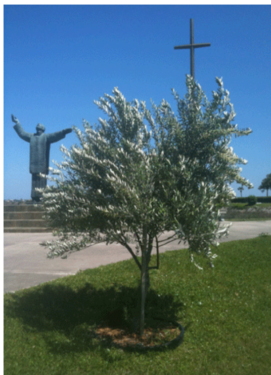
Blooming Olive St. Augustine, FL 2011

Today: Currently (2019) there are approximately 800 acres of olives under active cultivation in Florida. The groves range from back-yard hobby growers with several trees to 100+ acre commercial operations. In addition, several Florida nurseries propagate and sell olive trees for fruit production and ornamental purposes. While this diversity of Florida olive plantings is encouraging and recent successes with olives in South Georgia are of note; more hard science is warranted before significant investments of capital can be considered.