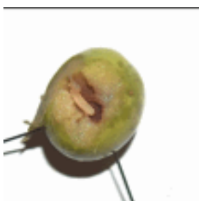
Olive Fruit Fly Damage

Little is known about pests affecting olive trees in Florida. There are reports of various insects (e.g., glassy-winged sharpshooters, Asian stink bugs, etc.) attacking the trees from time to time but Florida growers do not report significant pest damage, so far. See UF-IFAS publication: Pests and Fungal Organisms Identified on Olives ( Olea europaea ) in Florida.