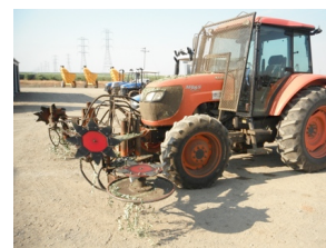
Low branch pruner

Pruning by hand labor is assumed at 36 hours per acre for experienced fieldworkers. Commercial high-density groves often use mechanical pruners (left-right). In medium-density groves, maximum tree height is kept at 14 feet. In high-density groves, where well-formed hedgerows are encouraged, pruning occurs at a height accommodated by the overhead harvester. Little pruning is conducted on "OFF" year trees; consequently average pruning over two years is 18 hours per acre per year for medium-density .