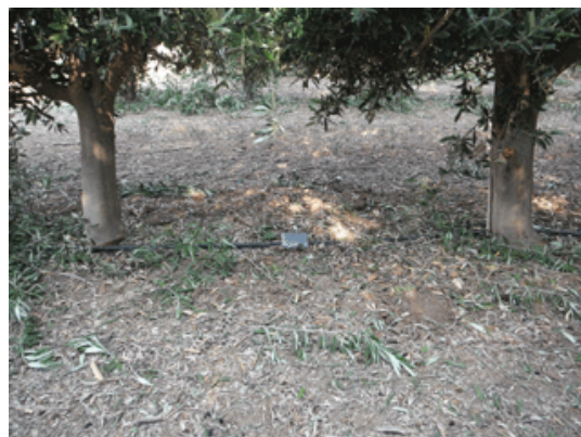
Super High Density Tree Spacing