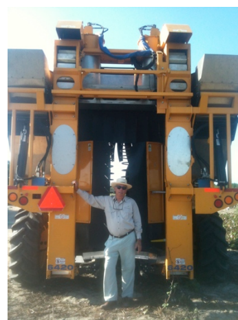
Overhead Olive Harvester

Fruit is picked at the color change ( veraison ) stage of yellow-green to red-purple skin color with white-green flesh, usually in late autumn. However, early fruit maturation has been noted in north central Florida with veraison occurring in early September. The Council plans to collect more accurate blooming, fruiting and harvesting information in 2014. Handling of the fruit is critical. Care is taken when harvesting so that the skin of the fruit is not broken nor the flesh excessively bruised, especially for table olives. Harvested olives are transported from the field directly to the mill for immediate processing.