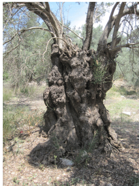
Heavily Pruned Old Olive Tree - Crete

Depending on the quality and age of the nursery stock and the desired grove configuration, young trees should generally be pruned once per year up to the age of three (3). Early pruning will focus on creating an 18"- 24" clear trunk at bottom of the tree to facilitate cultivation, enhance airflow and allow irrigation equipment maintenance. Considering a medium density grove, in year five (5) or when the trees reach greater than 6' wide, the central leader is sawed out. In years six (6) to nine (9), one or two internal branches are removed each year to gradually form an open vase shape with 3 to 4 main scaffold branches. Normal pruning is conducted in April in California on trees that have a heavy bloom ("ON" year) and are expected to have a heavy crop by keeping the centers open and thinning out tall upright branches to an outward facing lateral. Photo on right is 50+ year-old olive tree near Episkopi, Crete pruned to facilitate hand harvest.