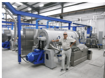
20T/Hr. Olive Mill