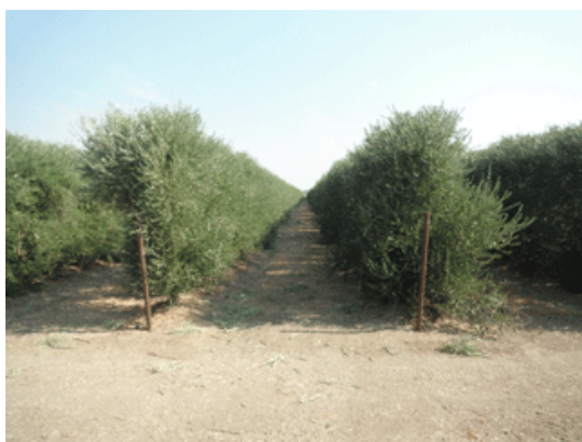
Super High Density Grove

Olive grove density decisions must consider Florida's generally higher humidity and summer rainfall - two conditions that usually don't exist in other olive growing regions. Olives are generally wind-pollinated, however, bees have been observed working blossoms in one Florida grove. Olives set fruit on less than 5% of the blossoms; therefore, it is important to maximize bloom and fruit set using appropriate densities and pruning methods. Untimely heavy rainfall and/or high humidity could have an adverse effect on yield due to reduction of available pollen and damage to blossoms. Insufficient wind penetration in dense groves may also impact pollination. There is some agreement amongst Florida and Georgia high-density growers that a spacing of at least 6 feet between trees is desirable. Below are photographs of a super high-density (SHD) grove in California. These are five-year-old trees are on five-foot (5') centers.