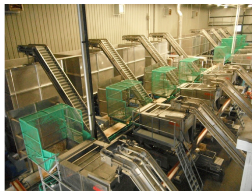
Olive Washing Stations

All processing must be conducted under sanitary conditions. Fresh fruit from the field must be cleaned and washed before crushing (malaxation) and oil extraction (using centrifugal force). Crop washing, leaf and debris removal and olive waste processing considerations are important for quality and inefficiencies drive costs upward. A high standard of cleanliness is required due to the sensitivity of the oil rendering process. Excessive impurities in the final product add costs.