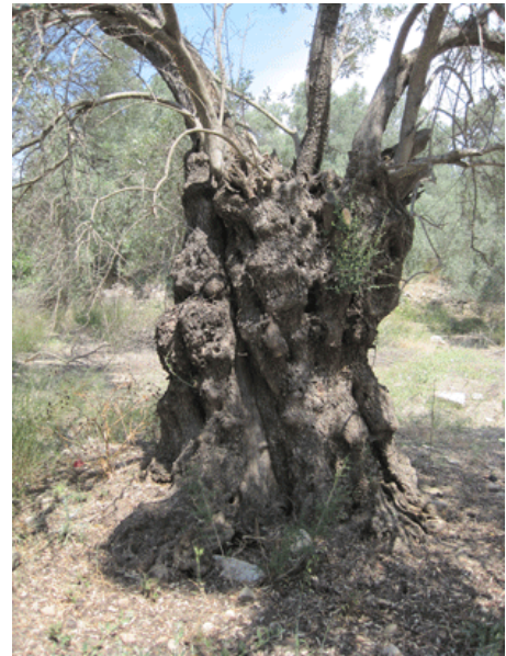
Heavily Pruned Old Olive Tree - Crete

Depending on the quality and age of the nursery stock and the desired grove configuration, young trees should generally be pruned once per year up to the age of three (3). Early pruning will focus on creating an 18"- 24" clear trunk at bottom of the tree to facilitate cultivation, enhance airflow and allow irrigation equipment maintenance. Considering a medium density grove, in year five (5) or when the trees reach greater than 6' wide, the central leader is sawed out. In years six (6) to nine (9), one or two internal branches are removed each year to gradually form an open vase shape with 3 to 4 main scaffold branches. Normal pruning is conducted in April in California on trees that have a heavy bloom ("ON" year) and are expected to have a heavy crop by keeping the centers open and thinning out tall upright branches to an outward facing lateral. Photo on right is 50+ year-old olive tree near Episkopi, Crete pruned to facilitate hand harvest.