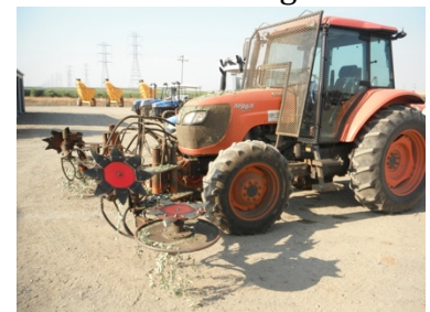
Low branch pruner

Pruning by hand labor is assumed at 36 hours per acre for experienced fieldworkers. Commercial high-density groves often use mechanical pruners (left-right). In medium-density groves, maximum tree height is kept at 14 feet. In high-density groves, where well-formed hedgerows are encouraged, pruning occurs at a height accommodated by the overhead harvester. Little pruning is conducted on "OFF" year trees; consequently average pruning over two years is 18 hours per acre per year for medium-density .